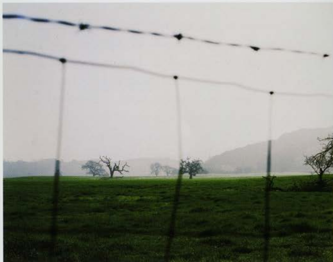
With none but the omnipresent stars to witness 2004 36 x 46 inches chromogenic print mounted on aluminum

the associative and eclectic forms of contemporary art. Not merely an exercise in revisionist history, Gonzales-Day's work has been sustained by an open-ended and phenomenological yearning, not for any one historical truth but for a layered and even poetic understanding of the past — the past as absence and as presence. For the Pomona College Museum of Art Project Series 30, "Ken Gonzales-Day Hang Trees," the artist is exhibiting photographs that engage in a dialogue with the well-trafficked traditions of landscape and auteur