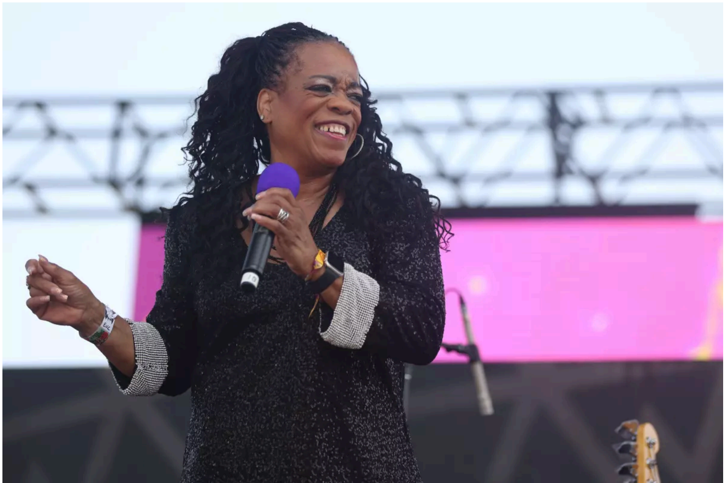
Evelyn "Champagne" King performs at the Fool in Love Festival in August.