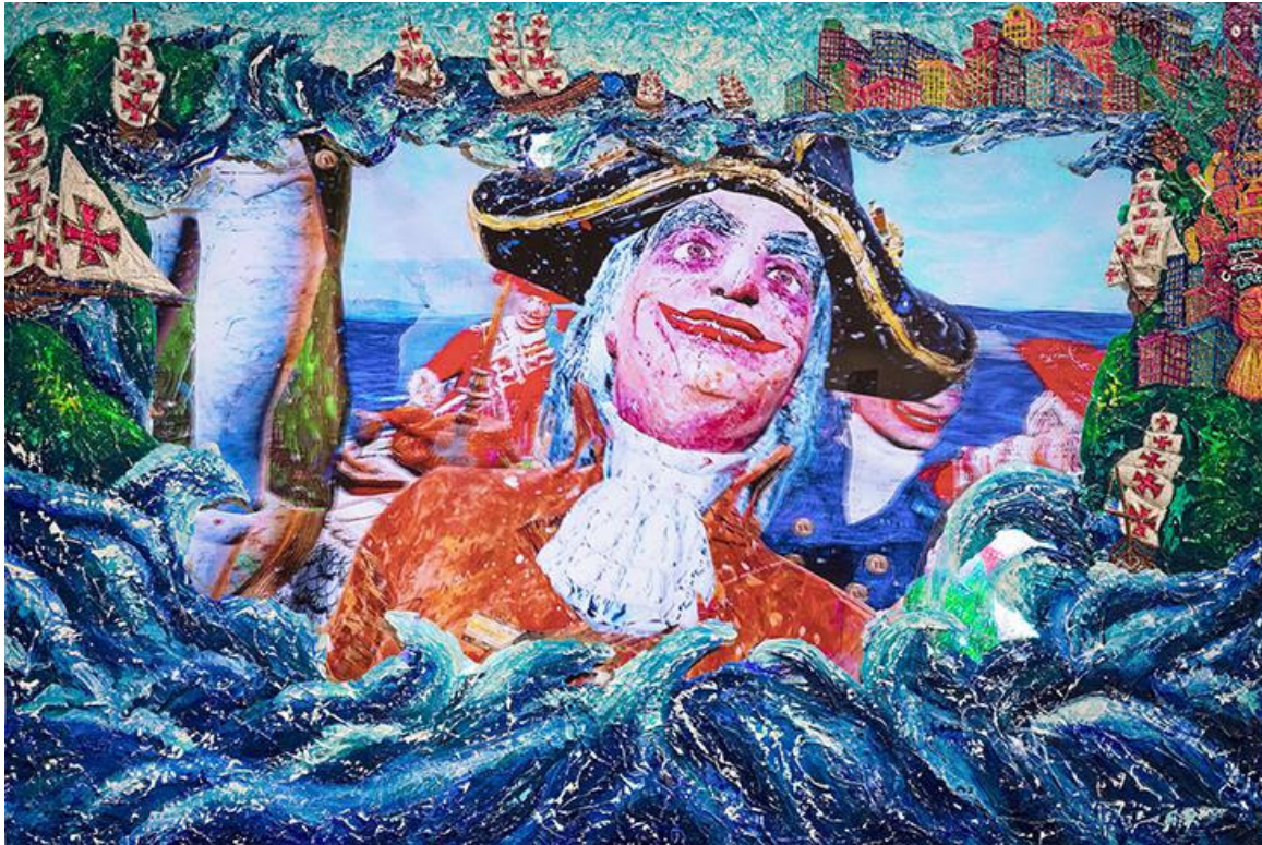
Federico Solmi, "The Indulgent Fathers," 2020, acrylic paint, mixed media on Plexiglas, LED screen, video loop, Plexiglas, acrylic paint on wooden frame, 72 x 48 x 5".

difficult to take in all of the intricate details, but the overall chaotic tone is perfectly suited to the subject.