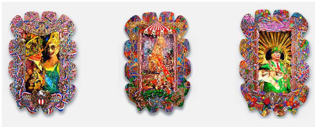
Federico Solmi, "The Drunken Boat; The Golden Gift; The Idolized Detractors," 2019, acrylic paint and gold leaf on Plexiglas, LED screen, video loop, 69 x 44 3/4 x 3 3/4" each

powerful elite from diverse historical moments. All are dressed to the nines in emblematic regalia as they indulge in drunken gluttony or frolic fully clothed in the pool at a Roman spa. At various moments they can be seen flailing their arms, applauding, and immersing themselves in gushing waterfalls. All the while they are accompanied by an orchestra that opens the drama and plays throughout its entirety. With everything shot from the vantage point of a person operating a video game, we view the performance from multiple perspectives, including up close and overhead. History buffs will particularly enjoy perusing the cast of characters, which includes Ramses II, Julius Caesar, Alexander the Great, Empress Theodora, Napoleon, Christopher Columbus, George Washington, Idi Amin, Pope Benedict XVI and other historical or recent power figures. To stress that the depicted debauchery continues to the present day, Solmi includes some contemporary references, such as sunglasses and a Jeff Koons "Balloon Dog."