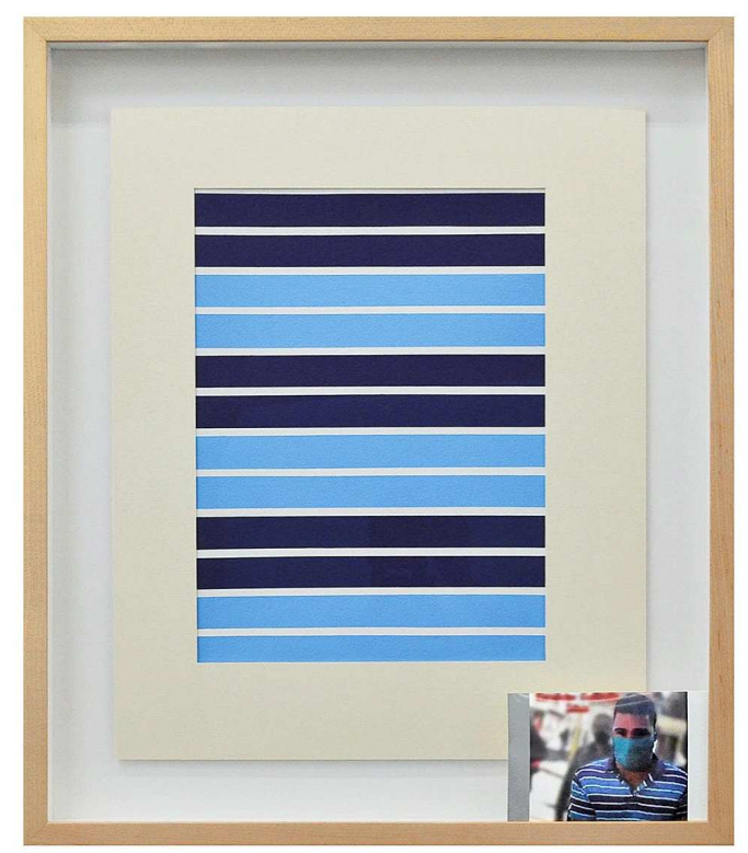
Page 9. Volume V. Tome 1, 2020. (Francisco Masó / Luis De Jesus Los Angeles)

The paintings in the exhibition represent only a fraction of Masó's ongoing series, Aesthetic Register of Covert Forces. He began it in the 2010s after noticing that secret police in Cuba had a penchant for wearing striped polos, a type of unspoken uniform. The show lands in LA at a moment when masked agents are ripping people away from their communities and looming over mass protests. It feels uncannily on the nose.